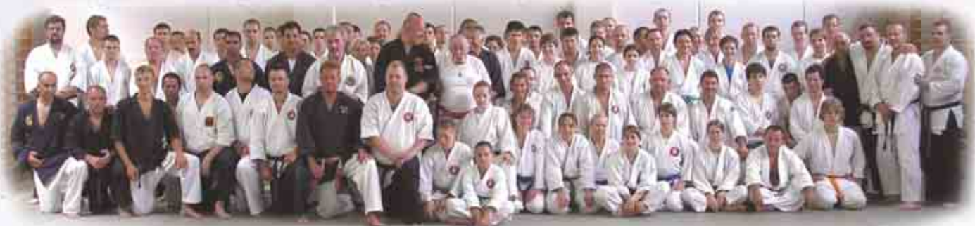
Participants of the training camp